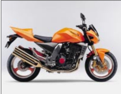
* Pearl Blazing Orange